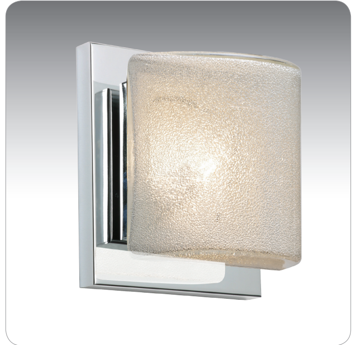
PAOLO SHOWN IN GLITTER (7873GL) IN CHROME FINISH